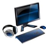
M. Muir – MLT K. Hettrick, R. Modzelewski - Art

Kindergarteners are becoming increasingly independent on the computers and are continuing to strengthen some of their academic skills in the computer lab. They are strengthening their Concepts of Print by focusing on capitalization, spacing and punctuation. They are becoming more comfortable with some computer features like WordArt, Clip Art and drawing.